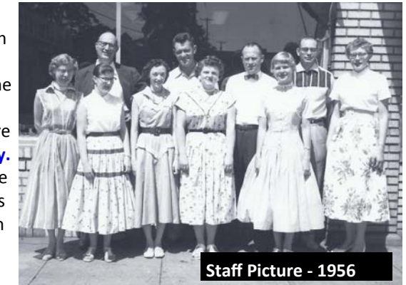
Staff Picture - 1956

After 90 years AMERICAN INSURANCE has become an inseparable part of the communities it serves. As a local employer we have had the privilege to touch the lives of thousands of our neighbors as employees, customers, with claimant payments, or civic causes. "Thank you" for sharing your life with us and for your continued trust and support.