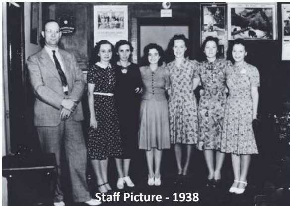
Staff Picture - 1938