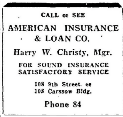
Shown at left: An ad found in the Tribune from 1/20/1946