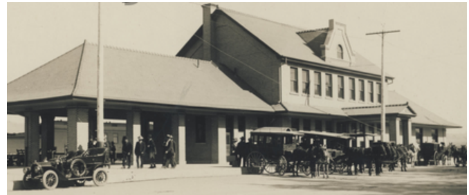
Downtown train station